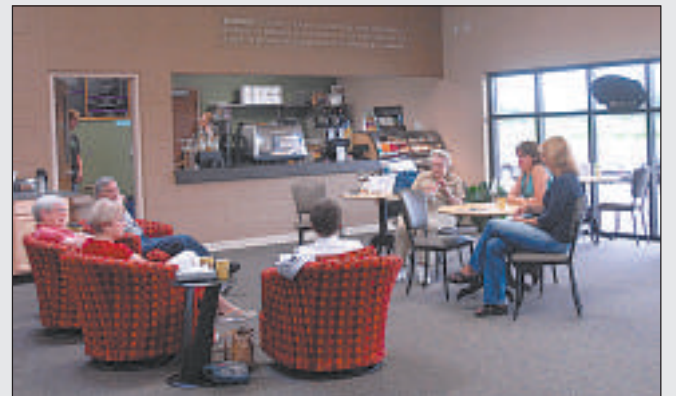
A group called the Older Wiser Lutherans meet for coffee inside journeys.

BULLOCK CREEK — A Midland County church hopes offering bigger, better caffeine kicks to motorists buzzing past will boost its 2,300-member fellowship.